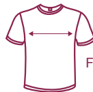
Flat Measurement of Chest

( ) XS-18" ( ) S-19" ( ) M-20" ( ) L-21" ( ) XL-22" ( ) XXL-23"